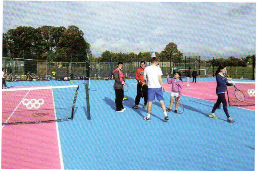
The new Olympic legacy tennis courts at East Park Farm, Charvil.